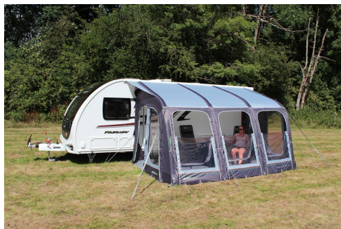
E-Sport Air 400

Outer front Height: 180CM Adjustable Height: 235 - 250CM